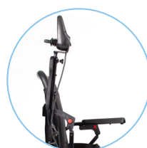
Flip up armrests