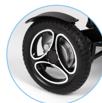
Stylish black/ silver hubs