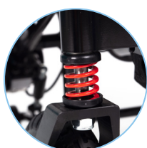
Front wheel suspension