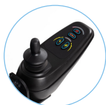
User friendly Intelligent controller

*Speed and range may vary depending upon user weight, type and incline of terrain, weather, battery charge and condition, operating speed and general driving situation.