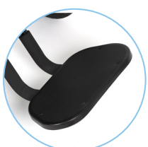
Flip up footrest (nonslip PU coating)