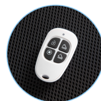
Remote Fold Operation