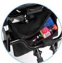
Handy underseat storage